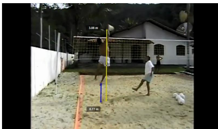
Figure 2 - The physical performance of the spike was measured with the Kinovea® software.

But recently, Marques Junior (2016b) recommended the volleyball coach and/or physical trainer film the game and after uses the Kinovea® software to determine the spike jump, the spike reach, the block jump and the block reach. This jump test measures the elastic explosive strength and/or the reflex elastic explosive strength, depends of the moment during the game. The figure 2 illustrates the spike jump of 77 cm and the spike reach of 3,08 meters with use of the Kinovea® software.